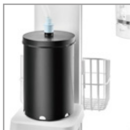
Gas filter canister